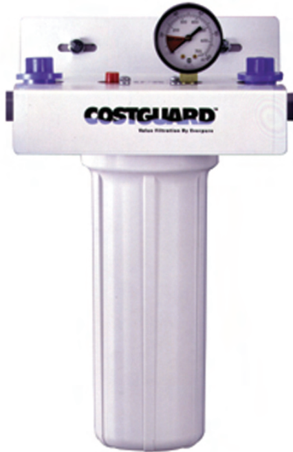
CGS-10 10" Single Housing: DEV9100-10